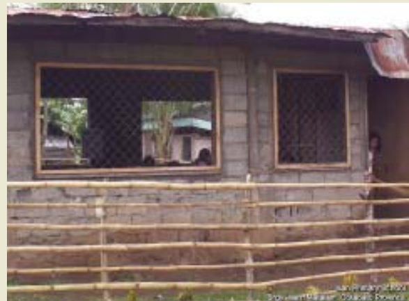
Ilian Primary School, Matalam, Cotabato