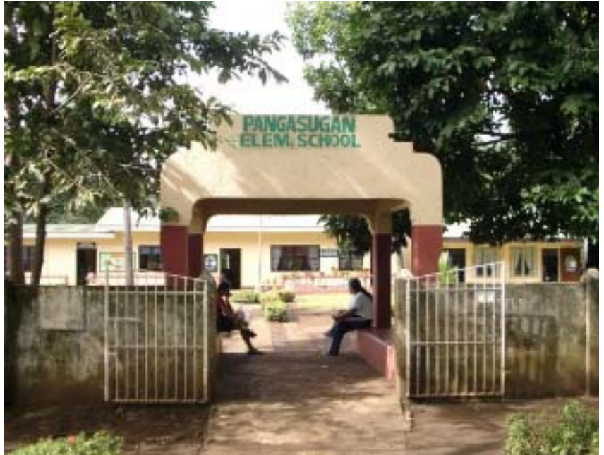
Entrance of Pangasugan Elementary School, Leyte

Classroom Supplies - Move On Philippines will provide basic classroom supplies such as notebooks, writing paper, pens and pencils, crayons, etc.