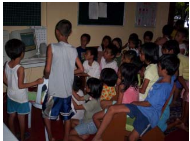
Students of Guadalupe Elementary School, Leyte viewing video clips displayed by the encyclopedia software installed on a PC donated by Move On Philippines.

Special Projects - - Upon approval of Trustees, Move On Philippines will implement special projects that facilitate access to educational resources by a large number of beneficiaries.