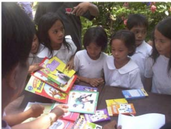
Sagkungan Elementary School in President Roxas, Cotabato.

The following individuals, corporations and schools have donated textbooks, library books, dictionaries, encyclopedias, software products, used desktop computers, printers, and other educational tools: