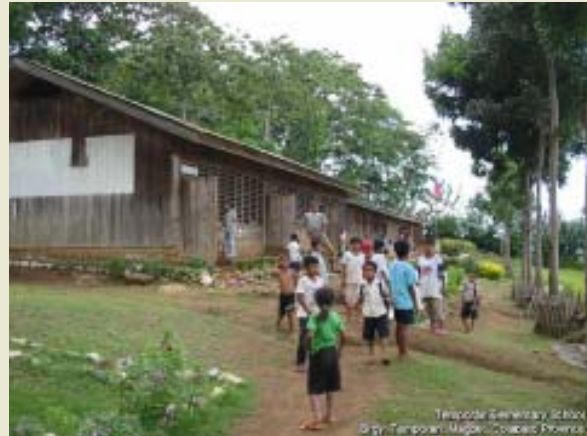
Temporan Elementary School, Magpet, Cotabato