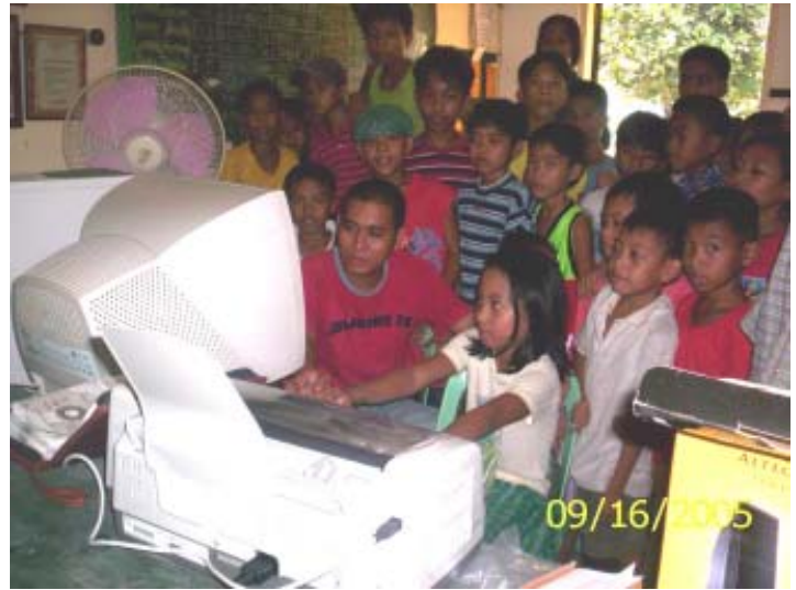
Students of Hilaan Elementary School, Leyte, are assisted by their teacher in trying out the donated PC and the educational software.

Camanlangan Elementary School, Compostela Valley