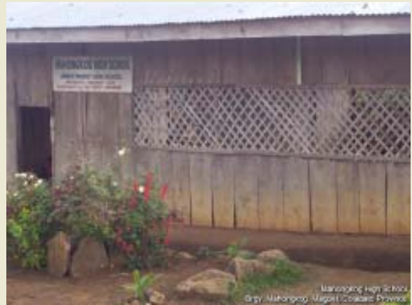
Classroom of Mahongkog High School, Magpet Cotabato