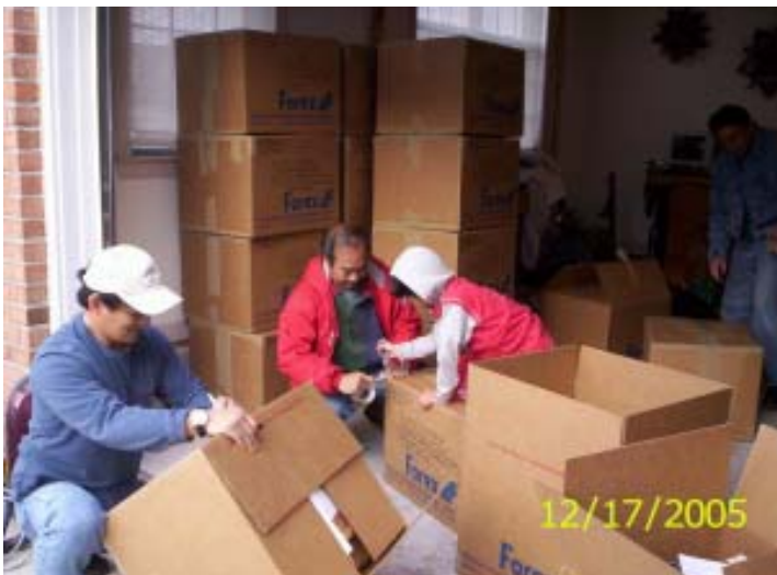
Volunteers from Baguio Fil-am Association and CPOA Tidewater packing resources for shipping to beneficiaries in University of Southern Mindanao - Kabacan