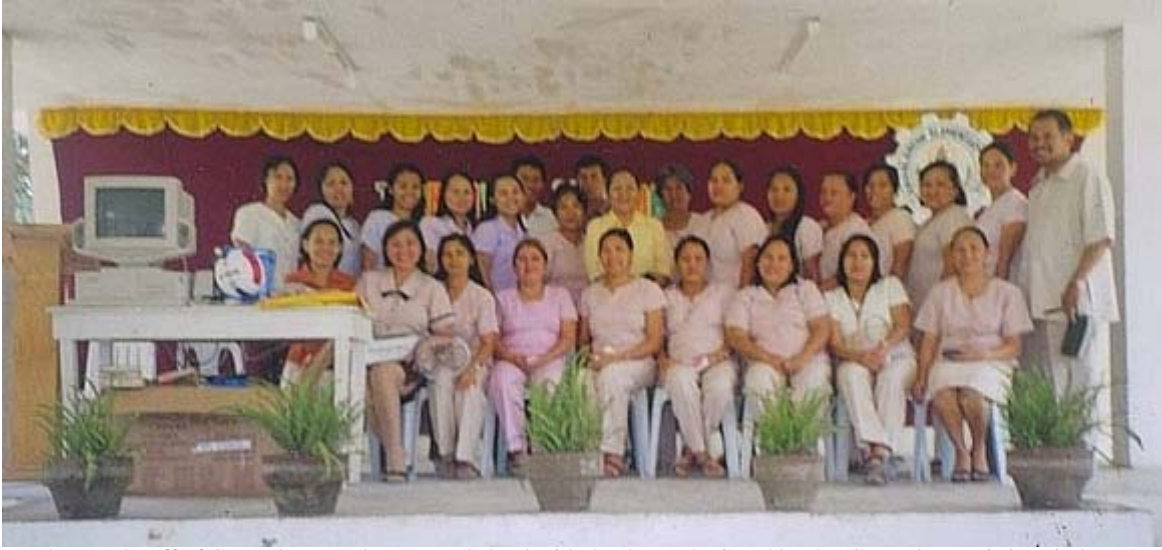
Teachers and staff of Camanlangan Elementary School with the donated PC and books. Camanlangan is in Mindanao's Compostela Province, five to six hours northeast of Davao City through rough roads and mountainous forested terrain.