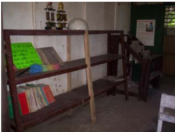
Library of Hilaan Elementary School, Leyte prior to applying for program assistance.

Emergency Relief - In times of natural disasters in the Philippines (earthquakes, typhoons, landslides and similar catastrophes), Move On Philippines will provide emergency relief to communities in need by coordinating shipments of used clothing and other basic necessities to communities in need.