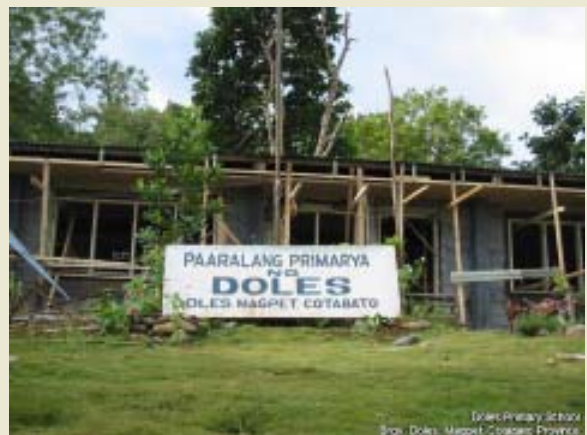
DOLES Primary School, Magpet, Cotabato