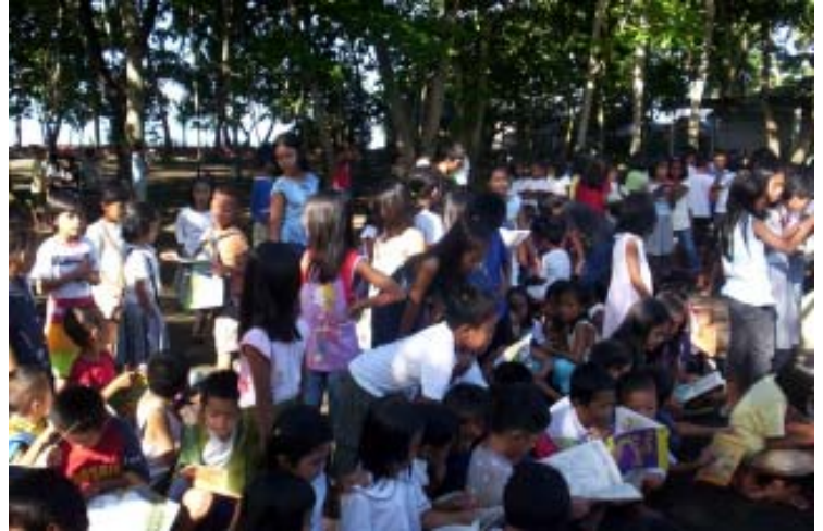
The joy in reading the donated books begins after the turnover, Guadalupe Elementary School, Leyte

Within a month after receipt of assistance, volunteers who facilitated the turnover are expected to provide a brief written progress report to the organization. The report contains the following information about the turnover: date, time, location, names and number of attendees, program of ceremonies (if any), narrative description of the turnover proceedings, comments from the beneficiaries, and photos of the event.