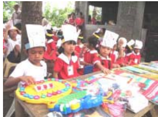
Donated books and toys for students of Lower Sirib Day Care Center in Sirib, Calinan, Davao City

Move On Philippines rely solely on generous donations by people who share our goal - - improving the quality of education for poor Filipino children.